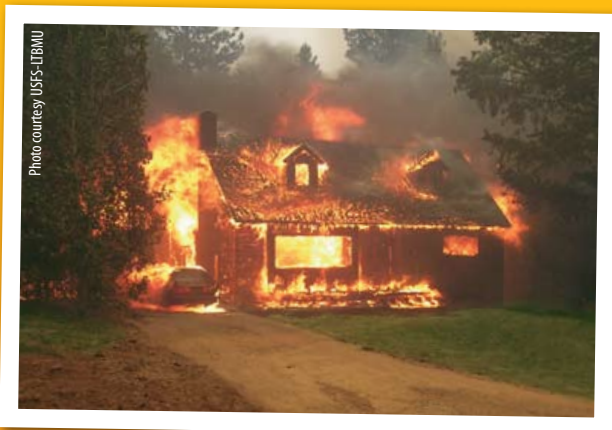
This house was ignited by burning embers landing on vulnerable spots. Notice the adjacent forest is not burning.

Maintain wooden fences in good condition and create a noncombustible fence section or gate next to the house for at least five feet.