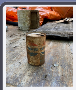
Best Trash Item-vintage Pepsi can. Frank Diterro (pictured below), finder.