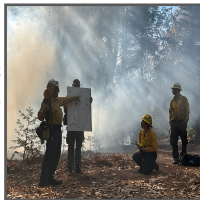
Weather conditions aligned with the Prescribed Burn Association (PBA) today, making it a perfect day to prepare and treat a 9.5 acre landscape in Cohasset. (Nov. 30, 2023 at the Maple Creek Ranch)

Do you want good fire on your land? Email goodfire@bcrnd.org and we'll help you get there.